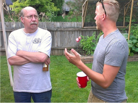
Share an afternoon together...

Brotherly Love, Relief, and Truth are the three Great Principles of the Masonic Fraternity.